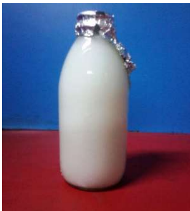
Figure 1: Control