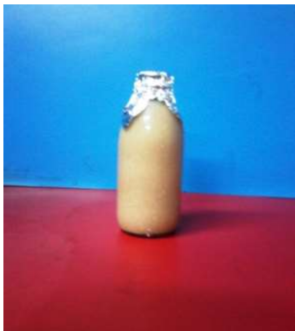
Figure 2: Cinnamon flavored Buttermilk

Trials were done to assess the percent concentration of Cinnamon extract to prepare the cinnamon flavored buttermilk among different concentrations. Among 5, 10, 15, 20% Cinnamon extract tested, 10% was found to be ideal for Cinnamon flavored Butter milk preparation based on sensory evaluation. Normal buttermilk without adding Cinnamon was used as control sample.